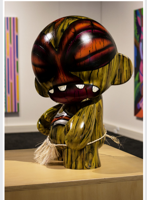
Master Z (Brown), acrylic on vinyl toy