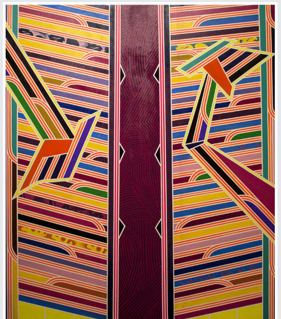
Wehi (detail), acrylic on canvas