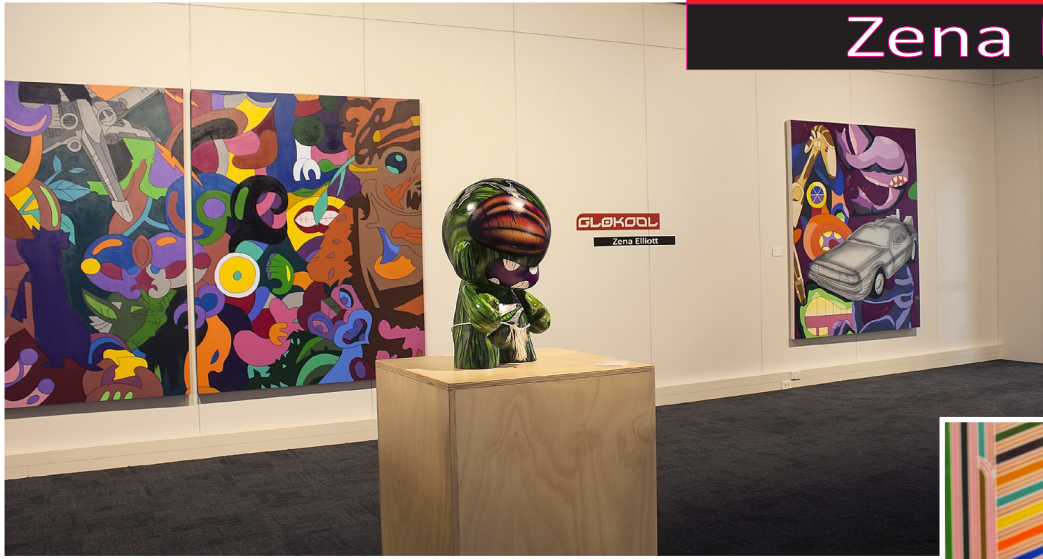
Familiar Spaces (diptych), acrylic on canvas; Master Z (Green) , acrylic on vinyl toy; Time Travel , acrylic on canvas