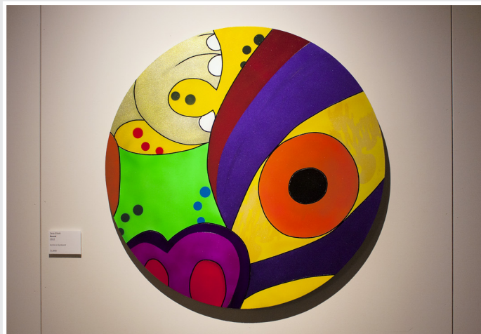
Round , acrylic on signboard