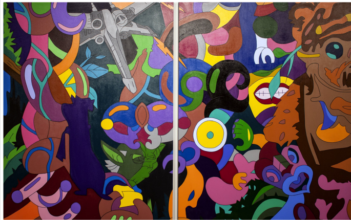
Familiar Spaces (diptych), acrylic on canvas