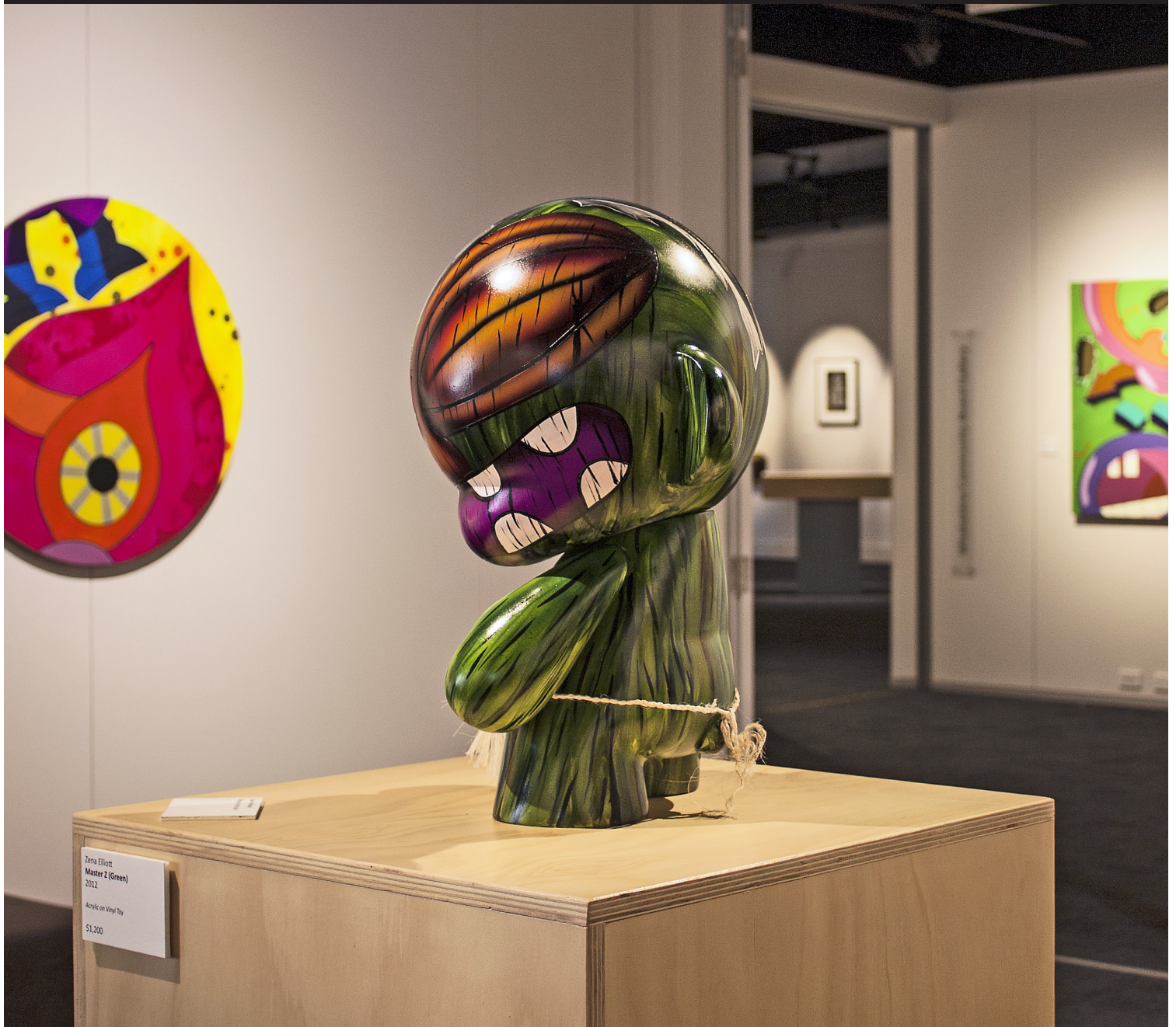
Zena Elliott Master 2 (Green) 2012 Acrylic on Vinyl Toy $1,200