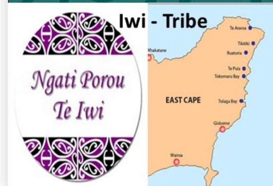
Iwi - Tribe