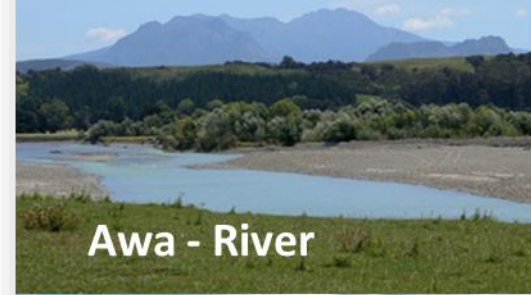
Awa - River