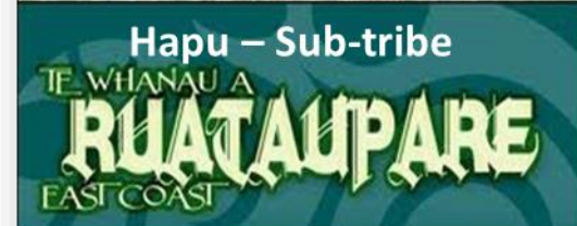
Hapu – Sub-tribe