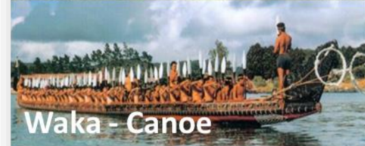
Waka - Canoe