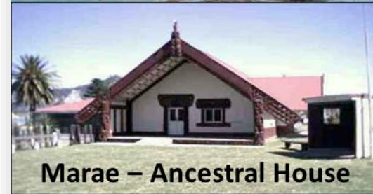
Marae – Ancestral House