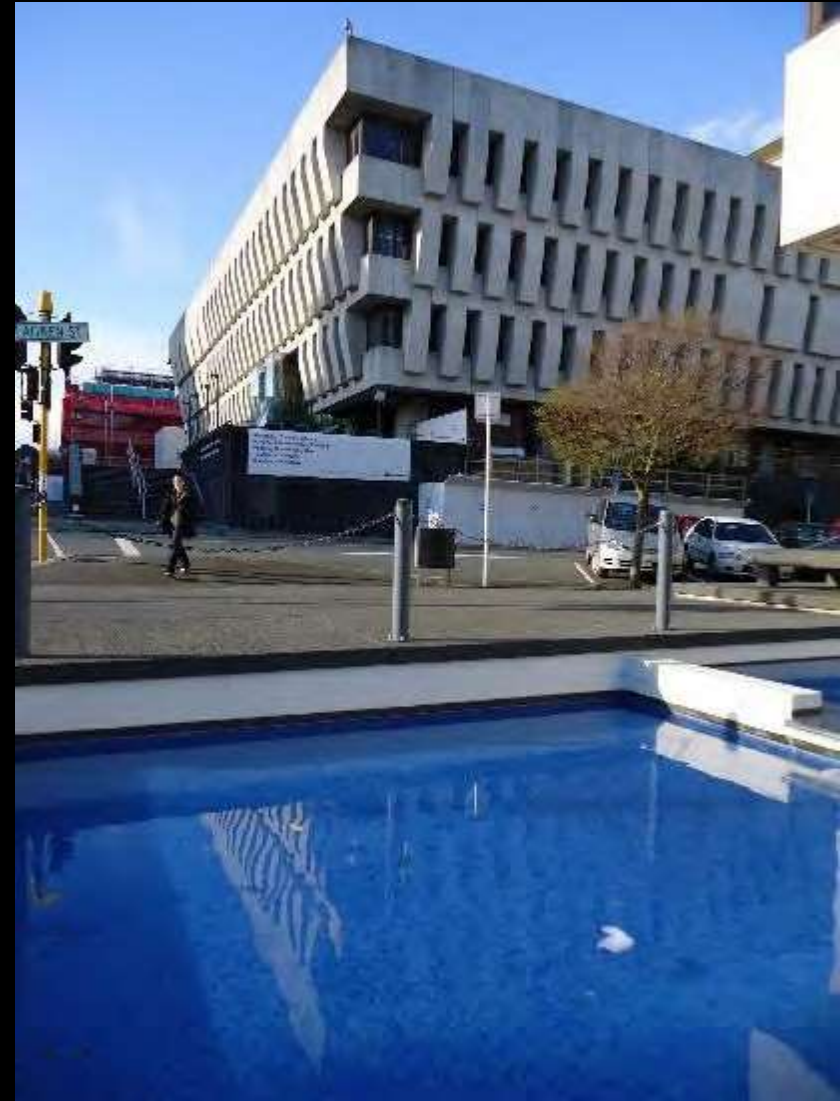
National Library of New Zealand