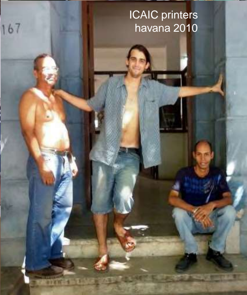
ICAIC printers havana 2010