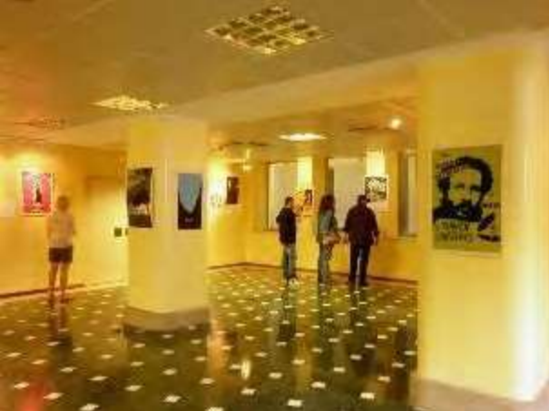
central post office • valencia • spain