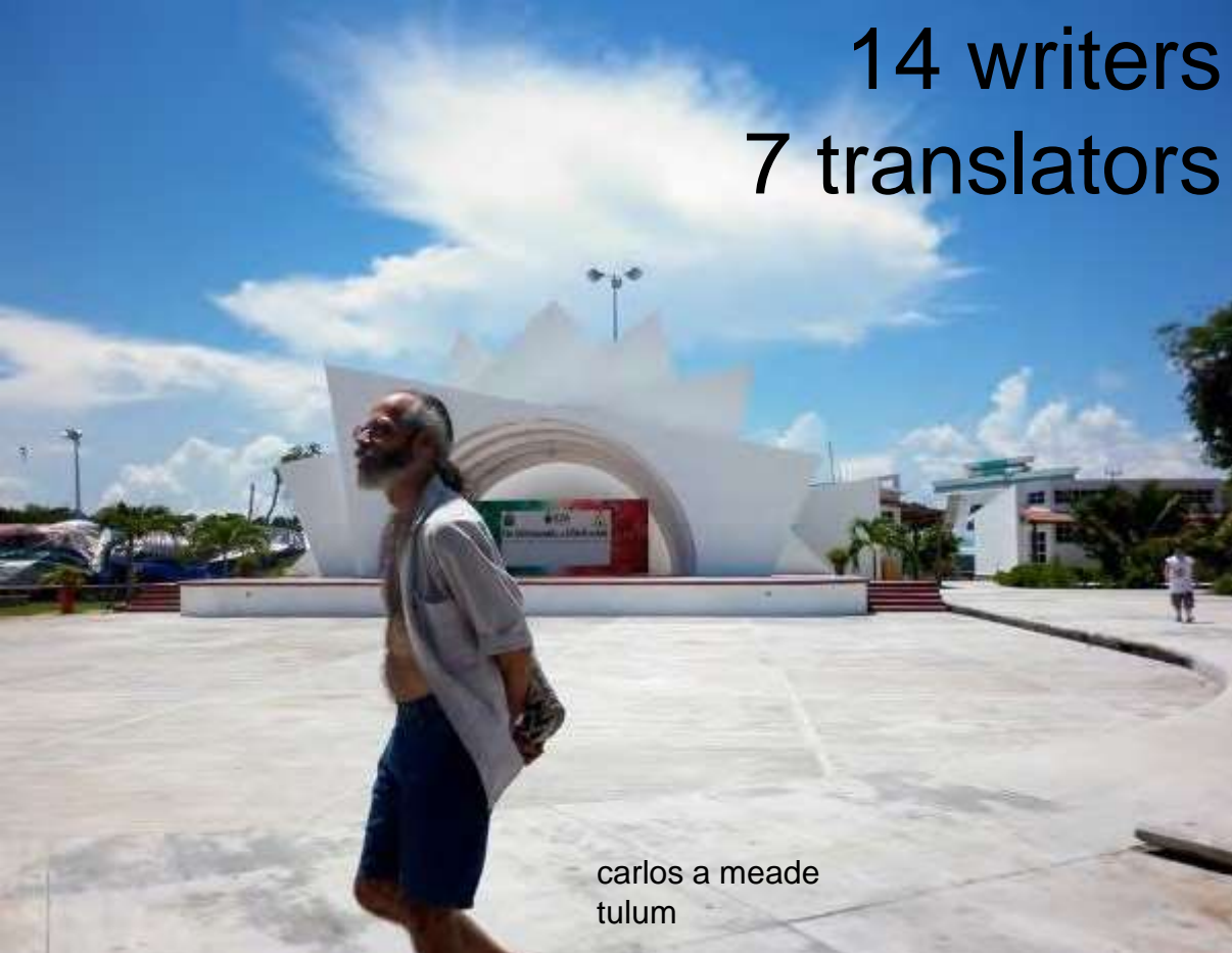
carlos a meade tulum