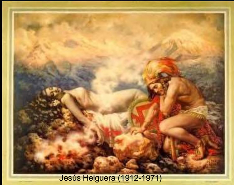
Jesús Helguera (1912-1971)