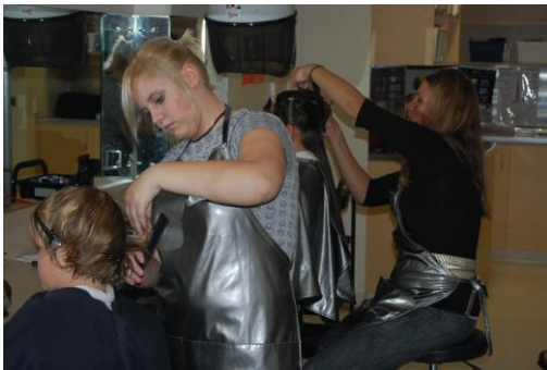
Certificate in Hairdressing Level 4 students working in the Wintec salon on a client night. 2008