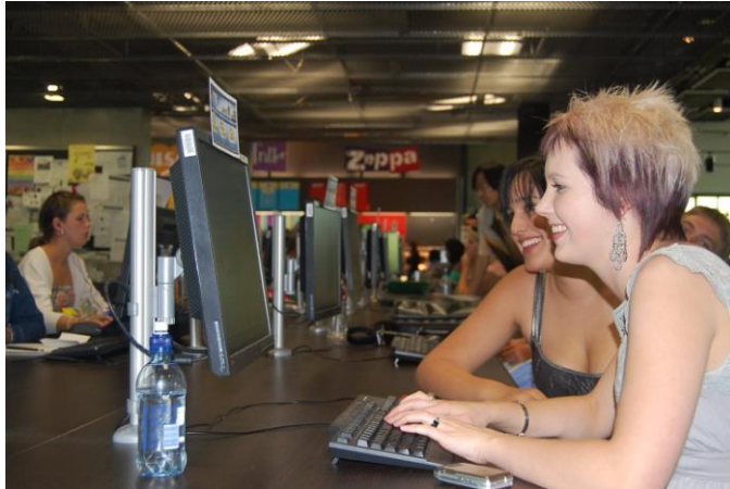
Certificate in Hairdressing Level 4 Students working online at The Learning Hub, Wintec 2008.