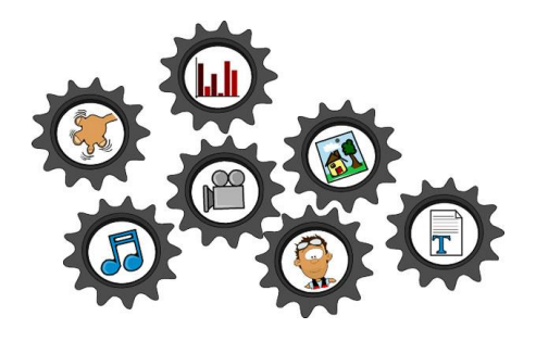
Figure 1 Assets: The cogs

At the start of the journey the project team found in some cases the "metaphor" of LEGO was used to explain underlying concepts of LOs (Long, 2006). In short small blocks of instruction (learning objects) could be clipped together to create a structured event (learning activity or sequence). You could, if you wanted re-use the small block in other structures. For example a map of New Zealand could be used as resource to indicate the physical relationships of a student's personal location with other towns or city's in New Zealand. The map itself could be re-used to indicate the location of rivers, streams and lakes or alternatively be used to describe geographical features such as wet lands, plains, hill country and mountains. These thoughts of re-use of discrete pieces of digital material appear to be based upon computer science object-orientated design (Downes, 2001) and because of this they had been labelled with the computer term of an asset.