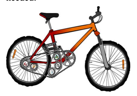
Figure 4: Learning Objects: The bicycle

From the OSLOR teams perspective it appeared confusion resulted if only one discipline was used as the basis for defining a learning object for educational purposes, a holistic approach is needed.