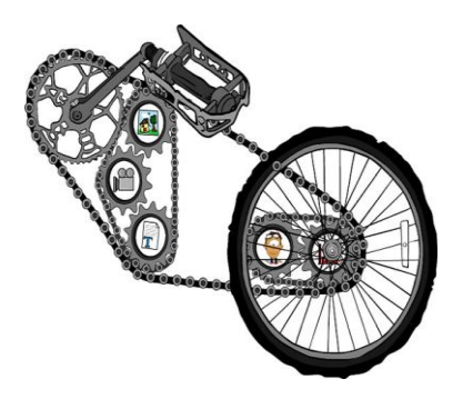
Figure 3: Information objects: The chain

However, are the digital collections created by the combination of two or more knowledge objects, the information object, a learning object? The team argued information objects should, indeed must, be linked with specific student outcomes for them to be useful. For example in the scenario described above there might be included student assessment activities designed for tutors and teachers to monitor and report on student progress against a specific learning objective. If knowledge objects are the links in the chain of learning objects information objects are the chains driving understanding (see Figure 3 on the left).