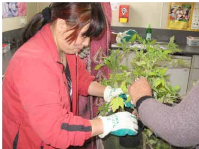
Table 9: Other benefits to migrant women, their families and communities

Additional perceived benefits were grouped according to the areas identified in the research objectives. Many of the women described their feelings of isolation, boredom and frustration that they couldn’t learn English until they started coming to the class. As a result of the class, they made friends and this led to greater happiness. I have observed these friendships develop and the support the women gave each other in and out of class.