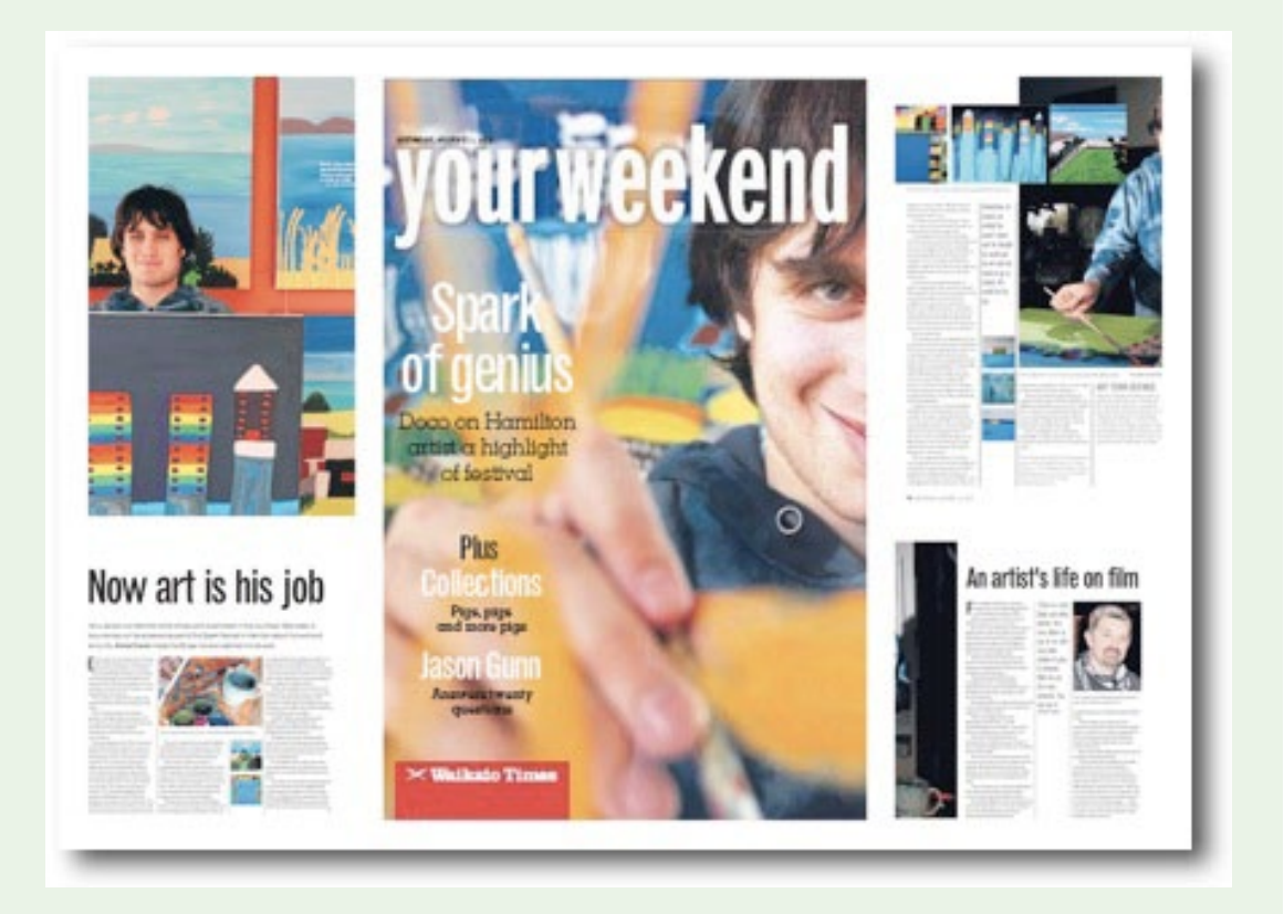
Illustration 3: Recent media article published about the artist

The first articles published about the artist were unassuming, as expressed in article location and word count. These articles were small and generally located at the back of the newspaper. Over the years, media emphasis changed to become more visible, edging all the way to the front page of the weekend magazine section and an insert in the front page of the newspaper itself. Similarly, the length of the stories grew from a succint 150-word column with one photo to a four-page spread including 14 photos in the last publication surveyed. This will be further described in Illustration 3 below.