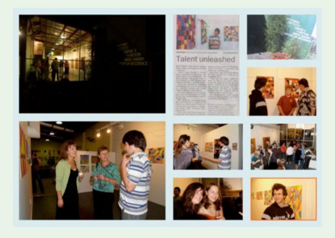
Illustration 1: Photo collage of the artist first gallery exhibition - at the age of 16.

ii. Our use of 'mixedabilities' and 'differently abled' is a form of linguistic activism that resists the inherent prejudice in words like 'disability' and 'impaired'. At the same time, we have instances of including them where it is impractical to replace them or they describe existing structures such as 'the disability sector'.