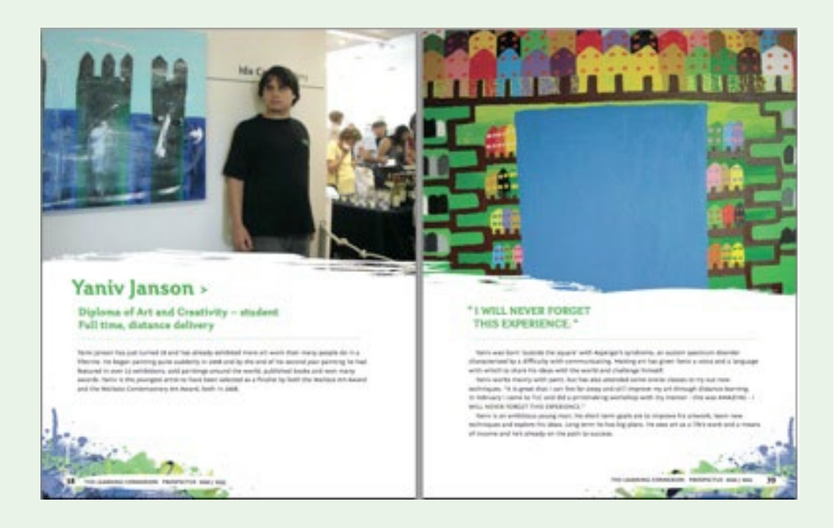
Illustration 2: Story about the artist as a role model from his Art School catalogue