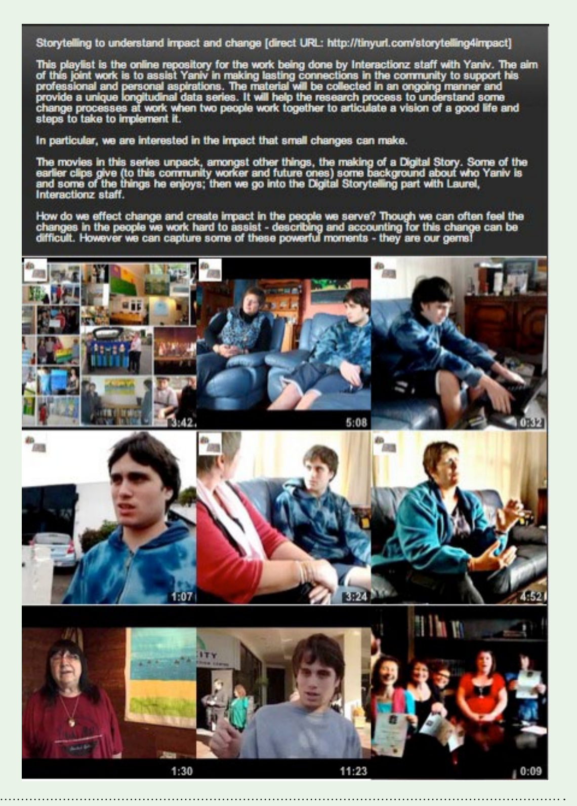
Illustration 6: Screenshot of the media list including the digital story with the artist telling his story

The storytelling intervention model was about deepening the connections between future professional goals and present personal action to help the artist understand what daily actions he could take to shape the successful career he wanted. It was crucial for him to understand that the momentum created around him needed to be sustained by his own actions. Since storytelling is fundamental to developing significant relationships, it was thought essential to help the artist articulate parts of his stories to deepen his networking connections as a result of face to face interactions. A community worker assisted the artist to produce a 'Digital Story' about himself.