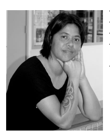
Tāmaki herenga waka Tāmaki whai rawa Tāmaki pai Tāmaki Makaurau Ko ngā kurī purepure o Tāmaki e kore e ngaro i te pō

On behalf of the Aotearoa New Zealand Association of Art Educators (ANZAAE) 2014 conference steering committee, it is my privilege to extend a warm welcome to you all.