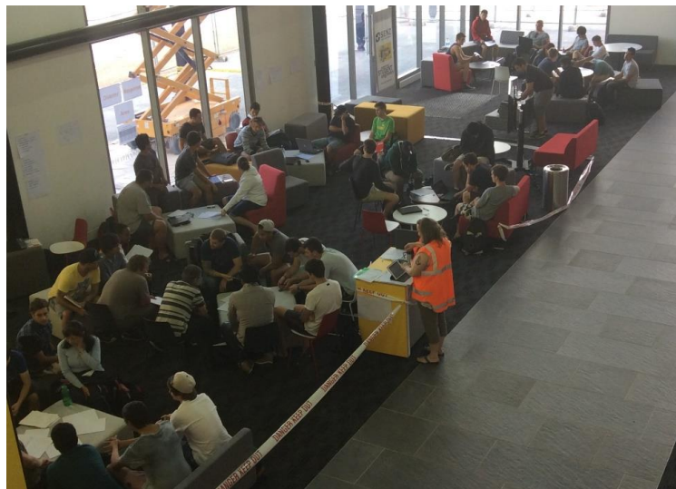
Figure 1: Students were placed into groups and placed in an open environment to simulate a disaster response unit.

On Monday 7 April, 2014, students arrived to an area that had been cordoned off with danger tape to mimic a civil defence response site. This area was organised into twelve groups with six people to a group (figure 1). Groups had been decided by the tutor prior to student arrival to ensure a mix of engineering disciplines, and full and part-time students. Students were required to introduce themselves to each other, and wear name badges as this may be the first time they had met.