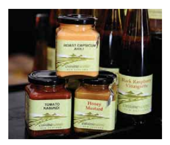
CUISINESCENE TREATS: Condiments carefully crafted by hand

"They're great. I ate so much last year I'm surprised I didn't get myself sick," he said.