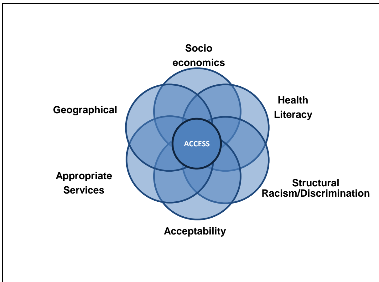
Diagram1: Factors related to and/or influence access to healthcare