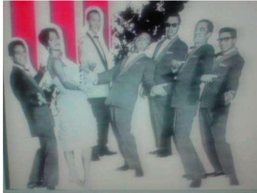
: The Maori High Fives (Stevens,1990c).