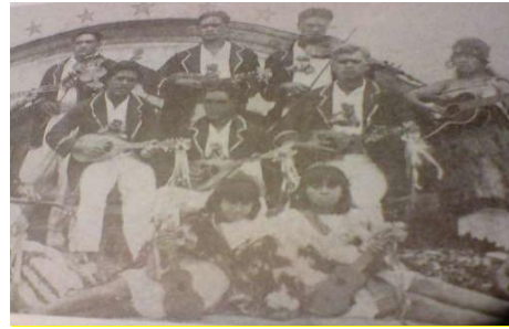
Te Pou Mangatawhiri Kapa haka group & band, December 1922: (King, 1987, p. 120 & 122).

One of the earliest groups known to perform and combine contemporary music with Kapa haka was called Te Pou O Mangatawhiri. In the Waikato during the influenza epidemic in 1918 that lasted from approximately October to December 1918. Many Maori parents died leaving children orphaned, homeless, abandoned and destitute. (King, 1987, p.99). Te Puea visited all the settlements between Mangatawhiri and the Waikato heads and gathered up all the children orphaned in the epidemic, it numbered just over 100 of them ( King, 1987, p. 101). The children were taken under her wing and were looked after by both her and the surviving adults. During the depression they were sent out into the European farms during the day to work for pennies milking cows and cutting scrub bushes (King, 1987, p. 118). The money was used to feed the community and among other things purchase musical instruments and clothing. During the night they would practice on their instruments. In 1921 Te Pou O Mangatawhiri or TPM was formed and created in two parts. One side of the group performed Kapa haka and the other half were a band that played an assortment of