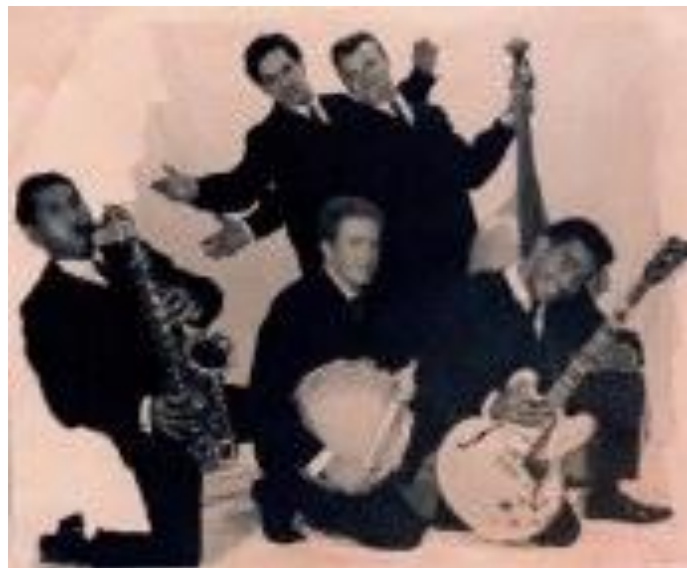
The Sun Downers (Manawa music,2002.)

The Maori show band community in Australia were small but close continuing to whanaungatanga or re connect each time a different Maori show band came into their area. The Maori show bands had what they called a showies code that meant if any band got into trouble, all the other show bands would come and help out (Peters, 2005, p. 41).