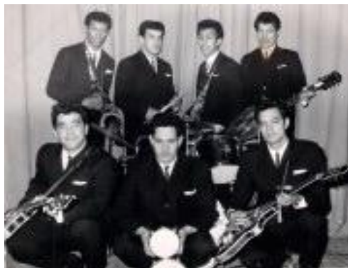
The Quintikis: ((Manawa music, 2002).