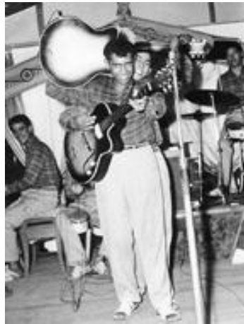
The Hawaiian Swingsters: (Manawa music, 2002).