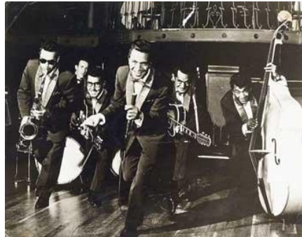
Maori Hi Fives 1961