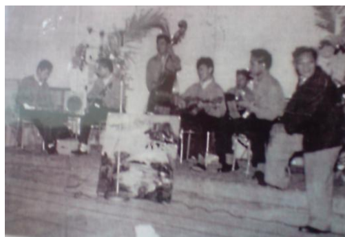
The Hawaiian Swingsters