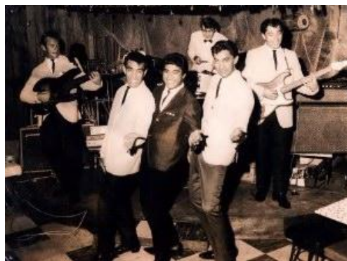
The Maori Cavaliers 1965: (Manawa music, 2002).

Music in its current context is a commodity based on capitalist expectations. Rather than performing live music, It is far easier to record in a studio and move volumes of product globally through the making of compact disks, ready for distribution, or moving music through web sites like http://www.sellaband.com/ . One of the impacts of this is that the entertainment x factor of the Maori show band entertainers in the 1950s and 1960s is not evident in most current Maori musicians.