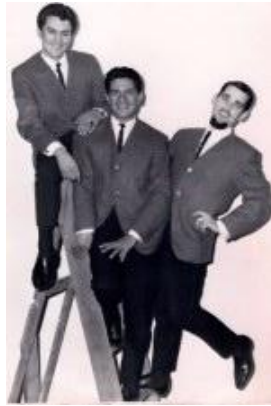
The Sheratons: (Manawa music, 2002).

The venues Maori show bands performed in were wide and varied. The Asia circuit included a stint in Vietnam during the war entertaining both the New Zealand and American troops. The Maori Volcanics shared some of their experiences in Vietnam. “I will always remember our farewell from the camp as the men stripped to the waist lined up along the route to the helicopter pad and performed a haka for us” (Peters, 2005, p. 99). Some areas and venues the Maori show bands performed at were potentially very dangerous, as Lenny Ormsby explains during one of the Maori Tikiwis gigs they performed in Vietnam.