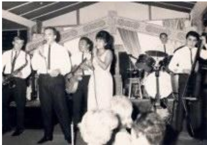
The Maori Castaways (Manawa music, 2002)