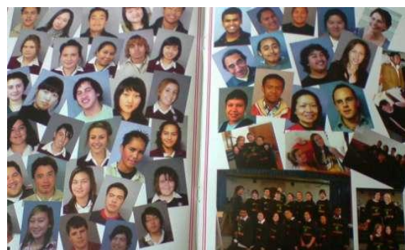
The band & cast:( Show band Aotearoa 2008)