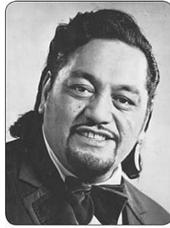
Prince Tui Teka (Last, 2008)