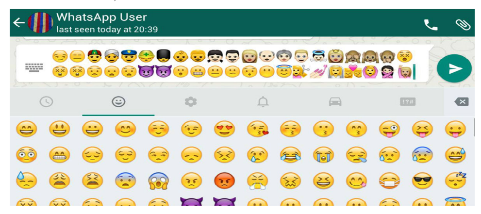
Figure 1 A sample of commonly used emoticons on social platforms (see online version for colours)