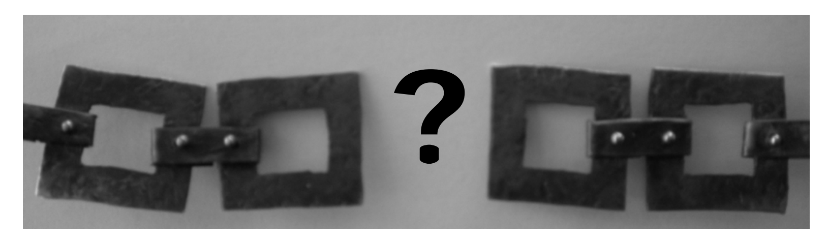
Finding direct evidence