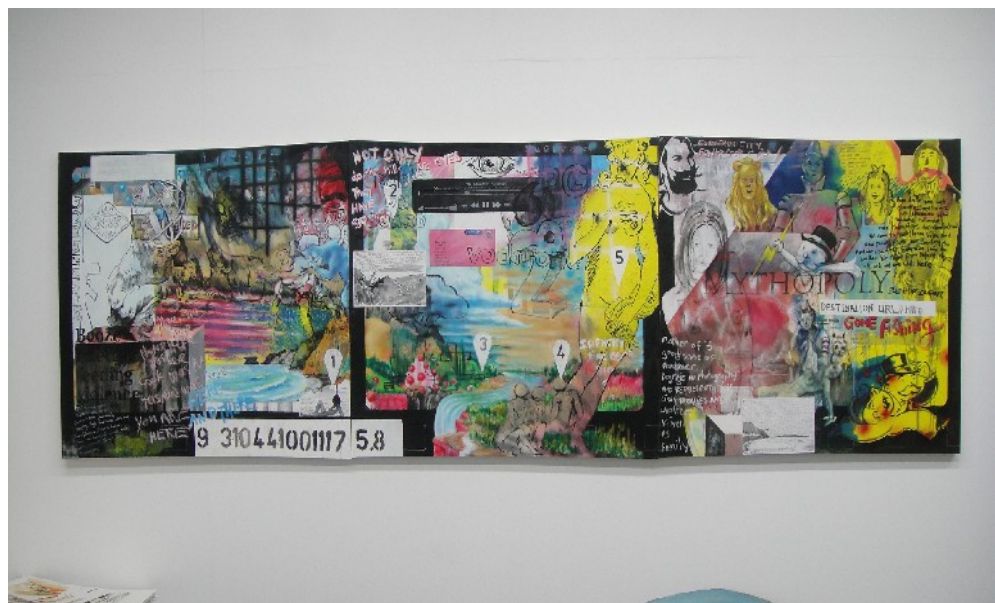
“WHAT DO YOU SAY, WHERE DO YOU THINK, WHAT DO YOU DO?”

A 'new' Sublime; 'Democratic Capitalism', mapped and presented as the New Land. Delivered to your mail box and T.V. set day and night. The land of empowerment and plenty, of self realisation. A place where you will be realised. A place to rest and to stand. A place where you can save. A land where all have enough to be generous. Is this the promised land that McCahons' The Listener , looked for?