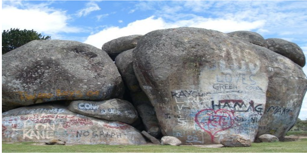
Thunderbolt's Rock, NSW. (Wright.2010)

A 'silent' and isolated land on which the colonist searched for identity and place in geographical isolation at the 'bottom' of the world, is now downloaded upon at high-speed. The economy has now framed and colonised the land whilst marketing identity. Land is as pretty as a picture, someone else's picture that you do your best to comfortably locate yourself within, (or without), with job, or without. Though, momentarily bored like us all, you can't help but write something into the view.