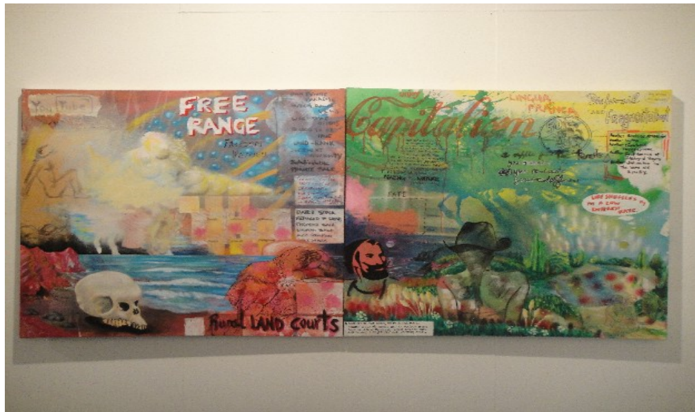
“WHAKARONGO KI TE AWA, LISTEN TO THE RIVER”. R.G.Shaw. 2011.

The texts layered upon my projects paintings co-mingle capitalistic coercive language with auto-ethnographic personal inscription in an attempt to make explicit a landscape/identity of dialectical intertextuality.