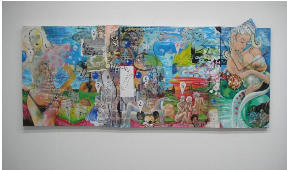
“A RIVER RUNS THROUGH IT – Contestable Lands, Debatable Identities.”