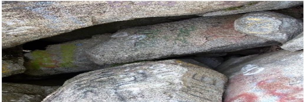
Personal text in the land. (Wright.2010)

constructions that are meant for public eyes (though not necessarily on public property) and that are visible to more than one person at the same time.” (Gade. 2003.p.447). Could these personalised affective scratchings of name and feeling upon rock and tree be the uncanny traces and essence of a Nationalist identity laying quietly and inherently in the land? Identity reflected in the fragmented emotive utterances of the other, persisting quietly outside the control of existing social forces? A deep strata of identity common to us all, quietly communing and commenting amidst the dominant discourse of the time?