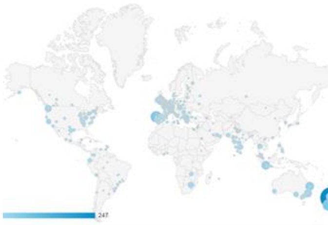
Figure 1: countries where users have downloaded QM from 1/8/2012 to 31/7/2013 (Google Analytics, 2013)

Question Machine was first available at the end of 2010 and has been downloaded approximately 741 times from 1/8/2012 to 31/7/2013 (Fendall, 2013). Google analytics gives a visual idea (figure 1) of the countries where it has been downloaded. QM is currently being evaluated by students who have done a user interface design course.