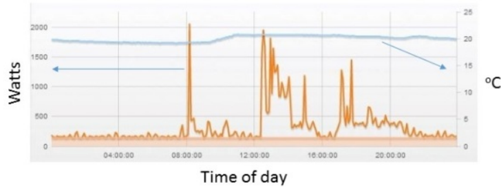
Figure 1. The lower plot shows the electricity use for a single day for the entire house being monitored. The upper plot shows the room temperature.