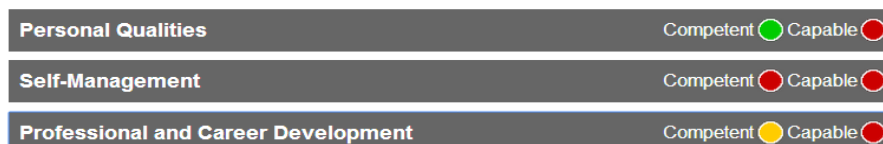
Figure 5. OTNA visual carpet

The visual carpet produced from learner engagement provides the learner with: