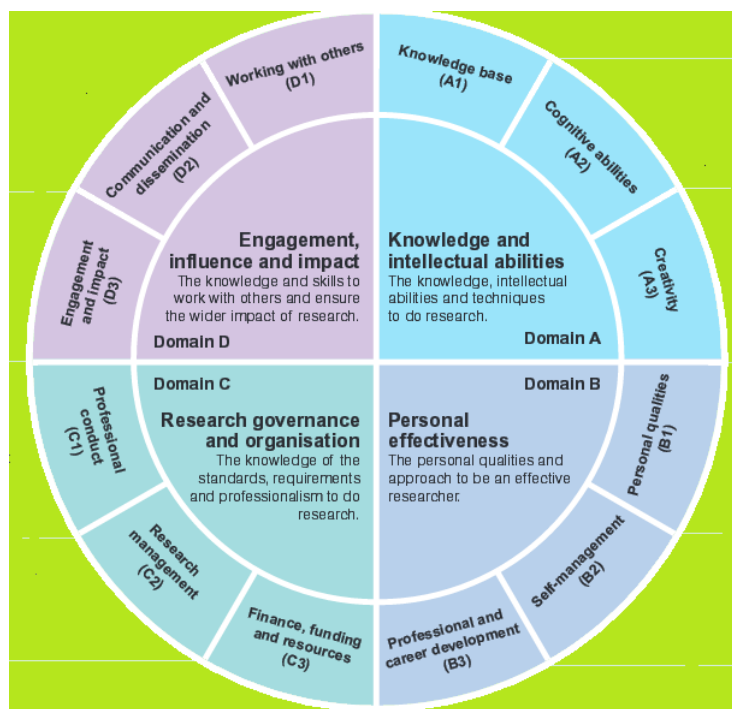
Figure 2. Researcher Development Framework (CRAC, 2010)

These domains and associated sub-domains establish the wide-ranging knowledge, intellectual abilities, techniques and professional standards required to undertake research, as well as the personal qualities, knowledge and skills to work with others and ensure the wider impact of research. They are illustrated in Figure 2 below: