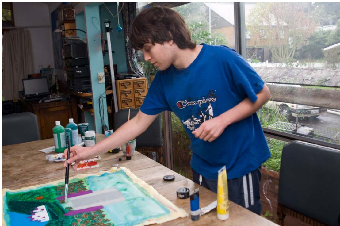
All photographs, 2011